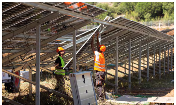
Example PV panels