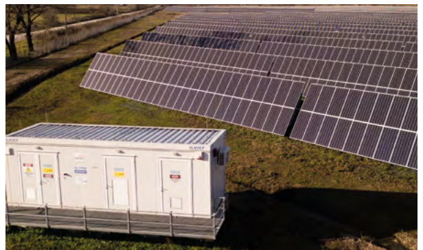
Example inverter/transformer station