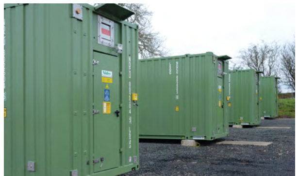
Example energy storage/battery