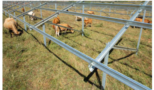
Example racking system