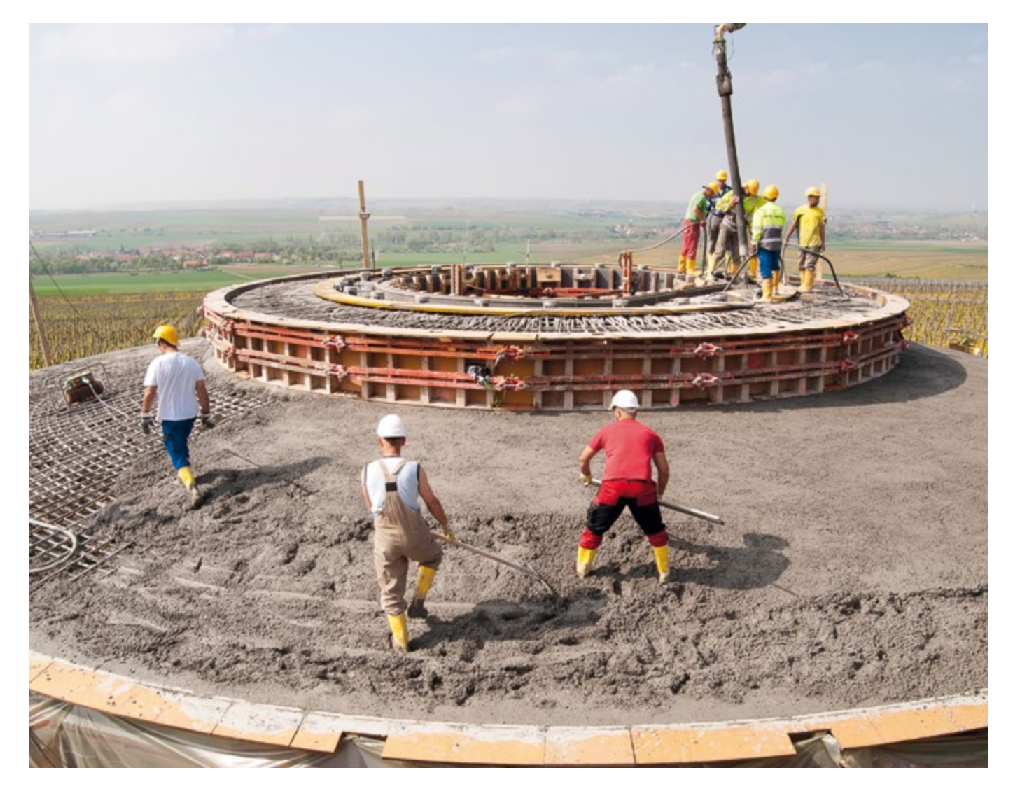
Before the turbine can be erected, a foundation is built