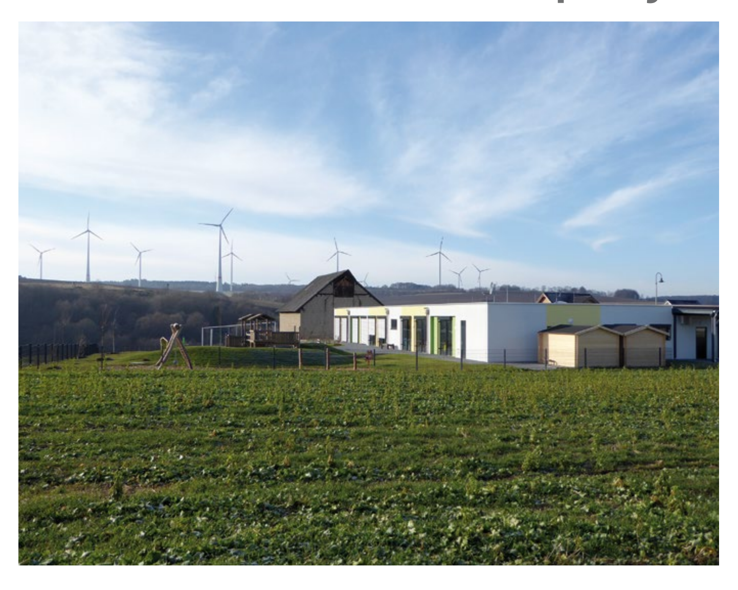
A new kindergarten in a village in Germany, financed by the wind turbines in the background

Infusion of $2 - 5 million in consumer spending such as hotels, food, retail within surrounding communities